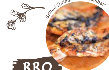
Grilled Shrimp "Black Sambal"