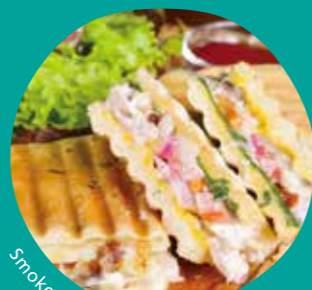
Smoked Bonito Panini