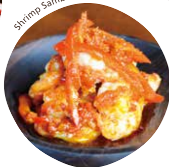
Shrimp Sambal Merah