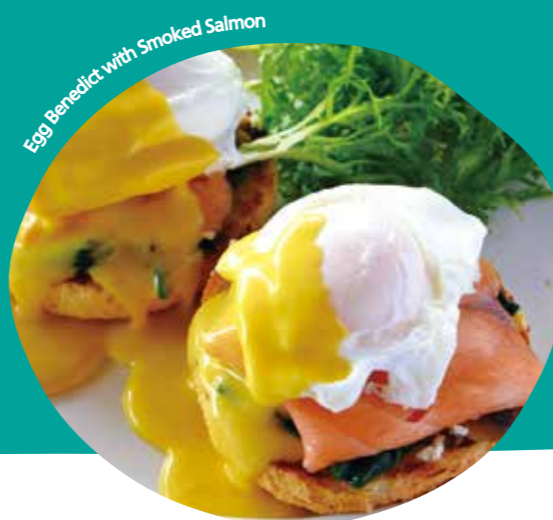
Egg Benedict with Smoked Salmon