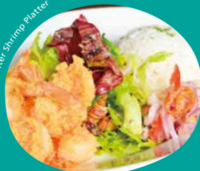
Garlic Butter Shrimp Platter