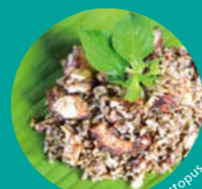
ALU Wrapper - Octopus