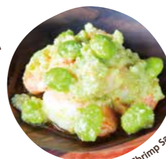
Shrimp Sambal "EDAMAME"