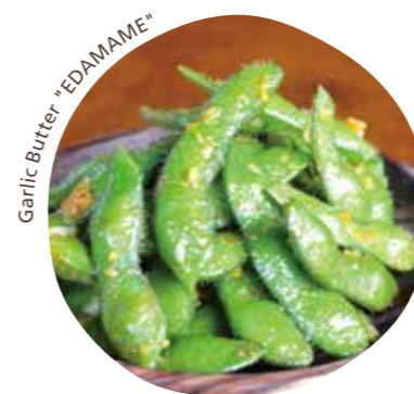
Garlic Butter "EDAMAME"