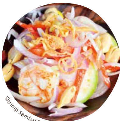
Shrimp Sambal Matah