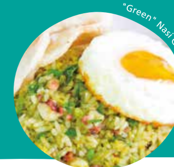
"Green" Nasi Goreng