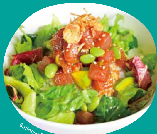
Balinese Tuna "Poke" Bowl Rice