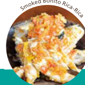
Smoked Bonito Rica-Rica