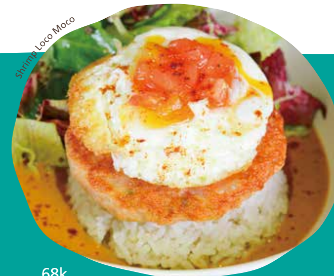
Shrimp Loco Moco